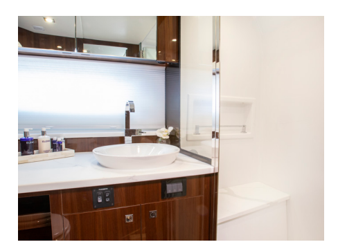
HEAD - The 50 GLS head features a sink, toilet, and separate shower stall. Storage hidden behind the mirror and underneath the sink allows you to tuck away personal items.