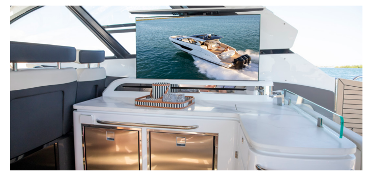
GALLEY - The galley features a fiberglass inlay sink, fridge, and storage. There is also an option for a second refrigerator. The galley is located in the cockpit for easy flow of conversation to guest sitting at the dinette. There is an optional pop up 55' TV.