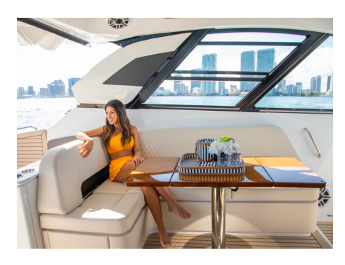
DINETTE - The portside dinette features a large, expandable table. Pull out wine bottle storages conveniently pulls out behind the seating countertop.