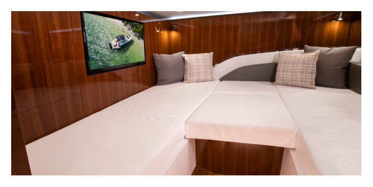
AFT STATEROOM & LOWER SALON The aft stateroom features a custom sized berth along with two facing chairs. A filler cushion can be placed to expand the berth area. The lower salon features a 32" Samsung TV, fridge, and microwave.