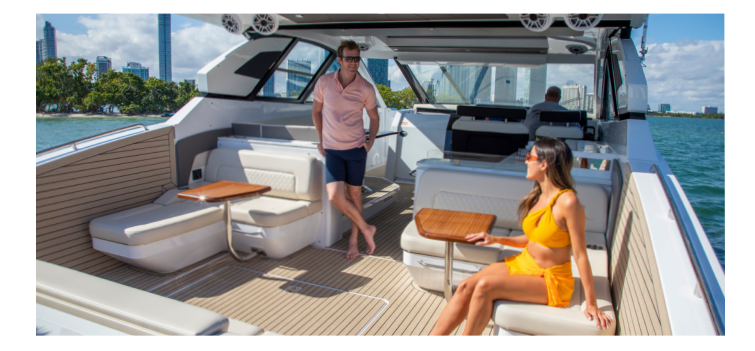
both sides of the 50 GLS to convert them into a swim platform. The 50 GLS' cockpit features a midship galley and opposing L-shaped seating area, two aft-facing L-shaped seating areas, and additional bench seating. The transom area features a standard grill, sink, and storage.