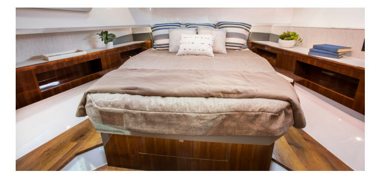
FORWARD STATEROOM - Need to rest for the night? The forward stateroom aboard the 50 GLS features a custom queen size berth, hanging locker, 32" Samsung TV, and personal reading lights. The French door for privacy and the skylight with opening porthole complete this room.