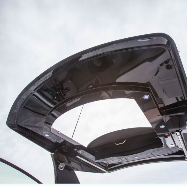
SURESHADE – For comfort, there is an opening sunroof along with an optional foredeck and aft deck shade to keep your guests out of the hot sun.