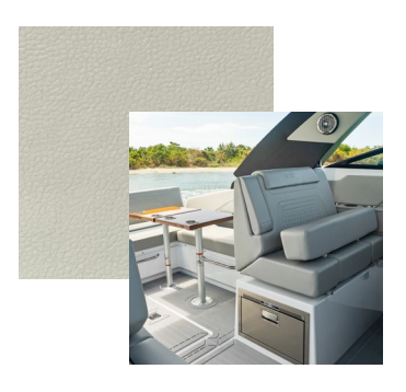
Dolphin Gray (Ultraleather)