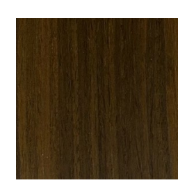
Dark Ebony Oak