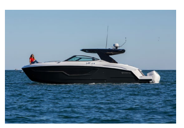
White Hull w/ Black Plank