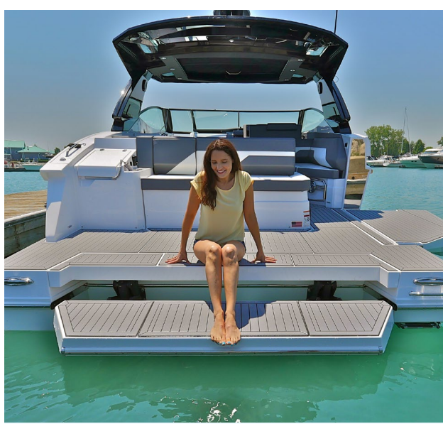
BEACH DOOR – Expand your swimming area by lowering the side of the 38 GLS to convert it into a swim platform. The optional hydraulic swim platform allows you to get in and out of the water with ease. The aft facing bench backrest can swivel to either face the cockpit or the beach door.

The 38 GLS just got sleeker with its new stern drive option. The combination of the expansive swim platform with the beach door allows you to have endless fun under the sun. The lower cabin features an aft stateroom and a U-shaped dinette that converts into a beth. A lower galley and standing head with shower complete this extraordinary yacht.