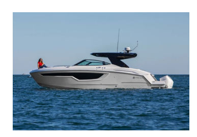
White Hull w/ Kingston Gray Plank