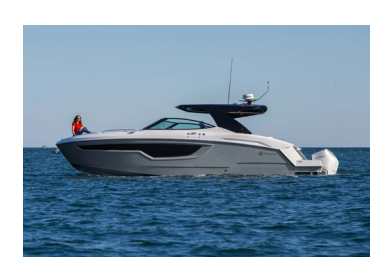
White Hull w/ Slate Gray Plank