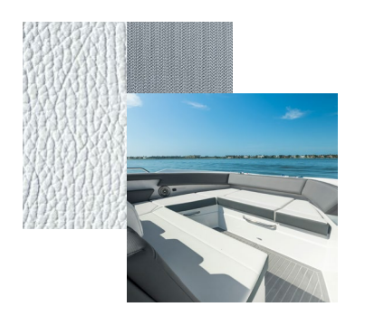
White & Gray